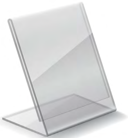
Small Ad - 5 x 7

Rich, potent, multi-active, antioxidant Vitamin C cream delivers dramatic skin brightening and anti-aging benefits to firm and tighten the skin. In addition, this highly effective antioxidant product combats the effects of aging caused by free radicals and oxidative stress.