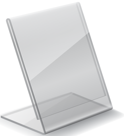
Small Ad - 5 x 7

Clinically proven combination of ingredients reduces the appearance of dark circles, puffiness and wrinkles around the eye area. Powerful peptides and vitamins promote collagen growth, strengthen capillaries and stimulate circulation, resulting in a brighter, rejuvenated and refreshed look.