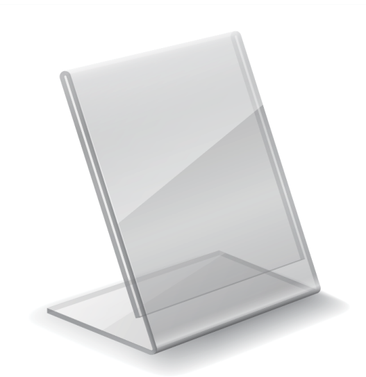
Small Ad - 5 x 7

A lightweight SPF 45, contains an innovative blend of actives that protects skin from multiple factors known to cause premature aging, including UVA, UVB and Infrared Radiation. Delivering a new strategy in sun protection, this product provides the highest possible level of protection while restoring youthfulness to the skin.