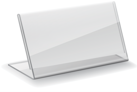
Shelf Talker - 3 x 1.25