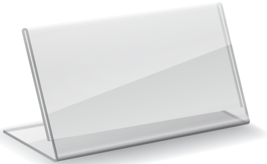
Shelf Talker - 3 x 1.25